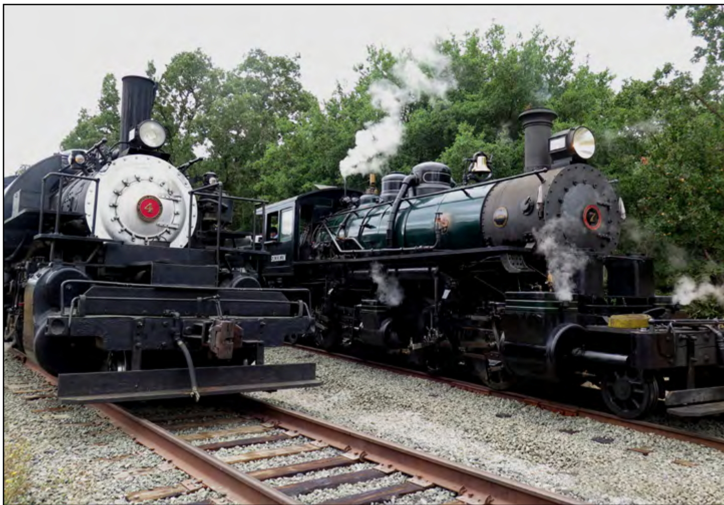
Both Clover Valley #4 and Skookum #7 at Sunol.