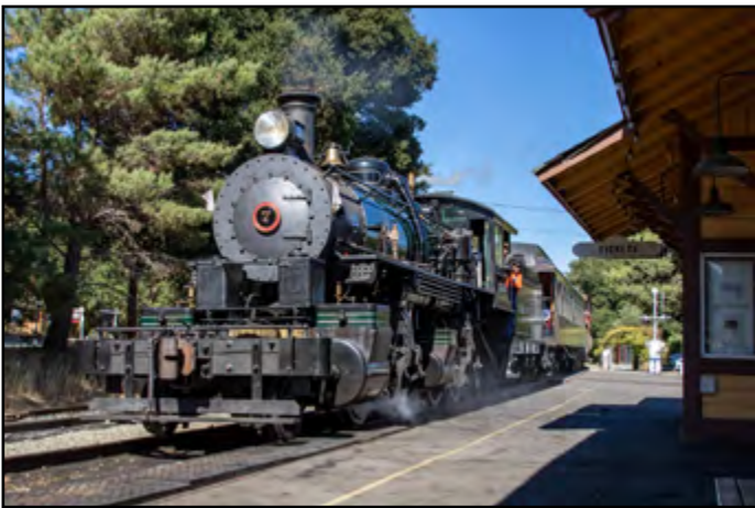
Another rare sight... With #7 facing West, it pulls the west-bound train past Sunol depot. A view of a west facing steam engine passing Sunol depot is rarely seen as most of the time our engines face East.