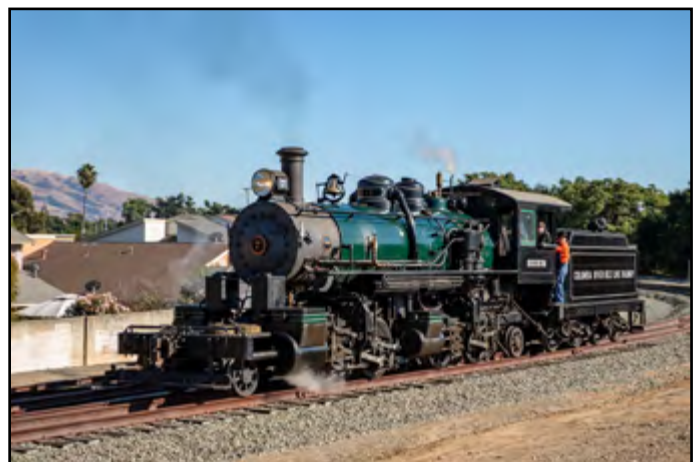
A unique sight... Skookum #7 rides the Niles wye at the end of the day to return it back to east facing for the next day's photo specials.