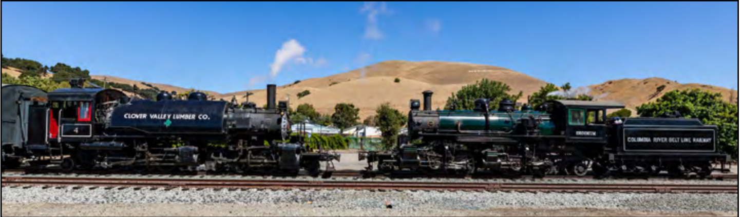
Clover Valley Lumber Co. #4 and Columbia River Belt Line Railway 'Skookum' #7 sit nose to nose in Niles prior to the start of the afternoon's special 150th Anniversary of the completion of the Transcontinental Railroad to the Pacific VIP train.