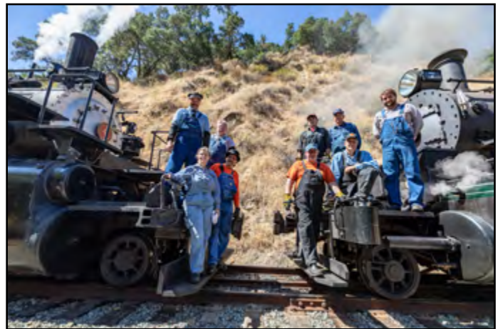
The NCRy Steam Department poses with their engines during the canyon ceremony.