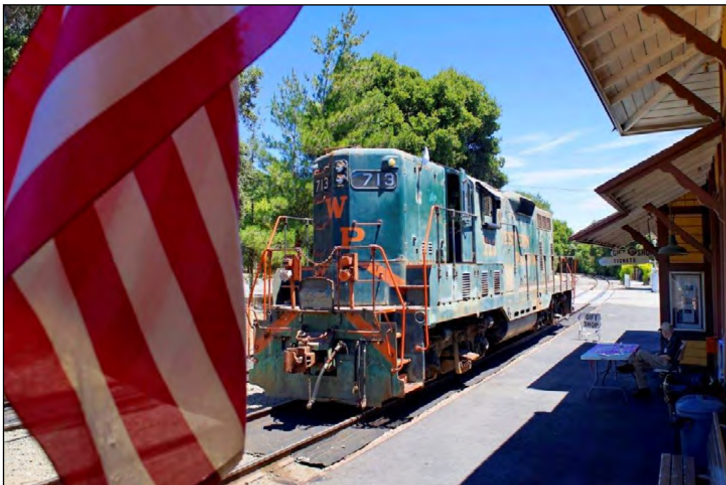
American iron at Sunol during regular operations.