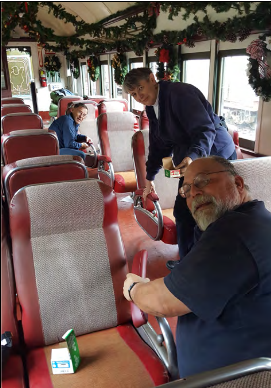
Sat group putting on armrests for seats in 315.