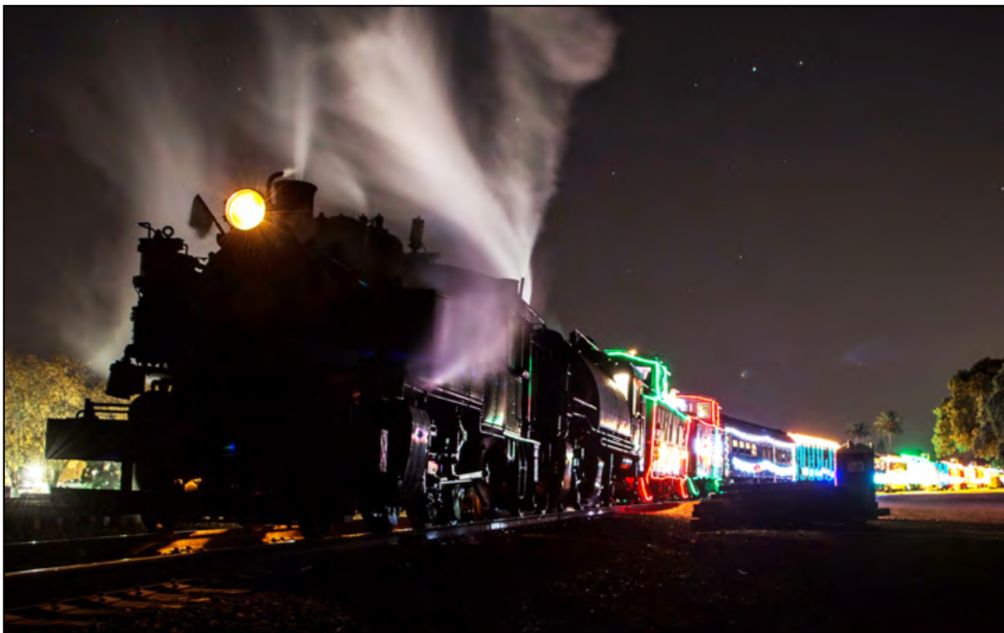
Steam powered Train of Lights from our 2015 collection.