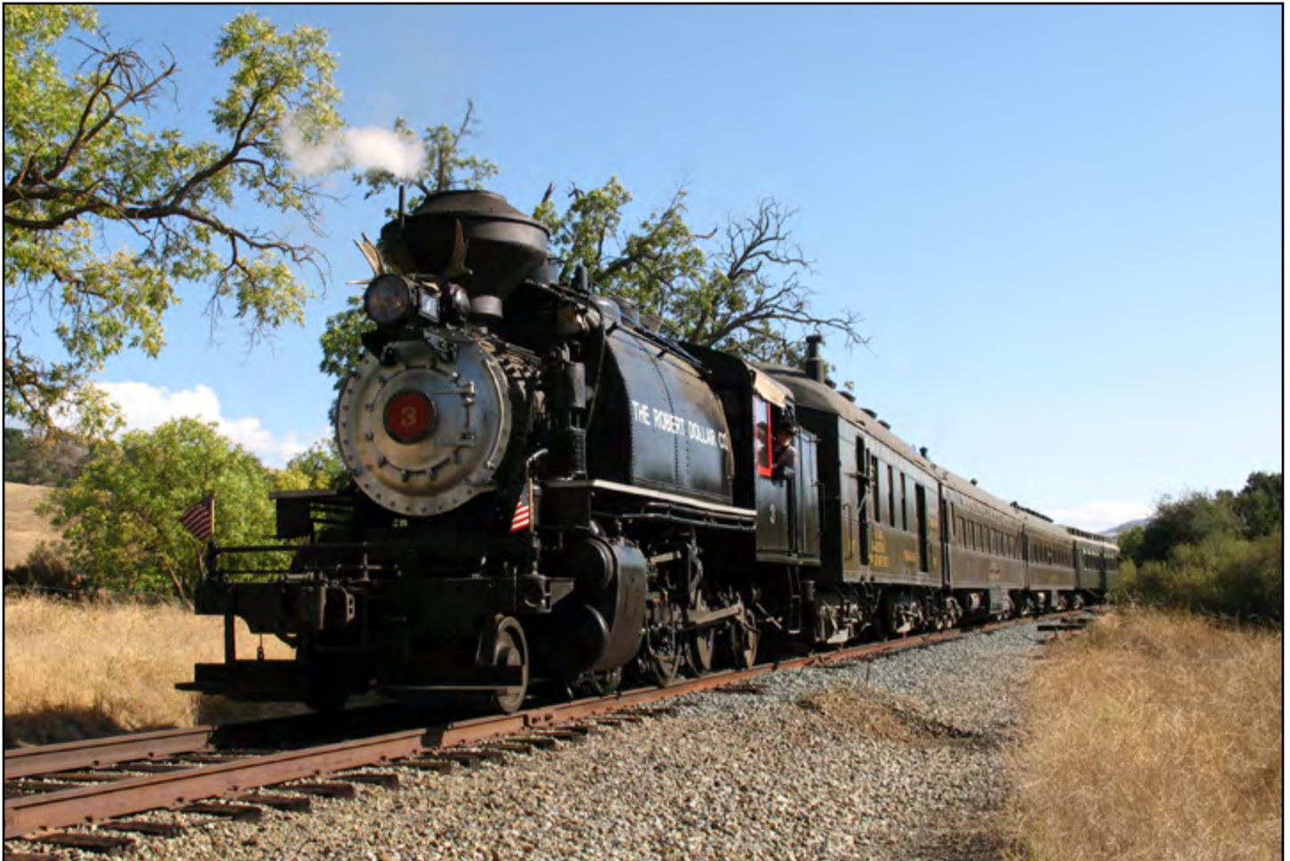
The Robert Dollar excursion train.