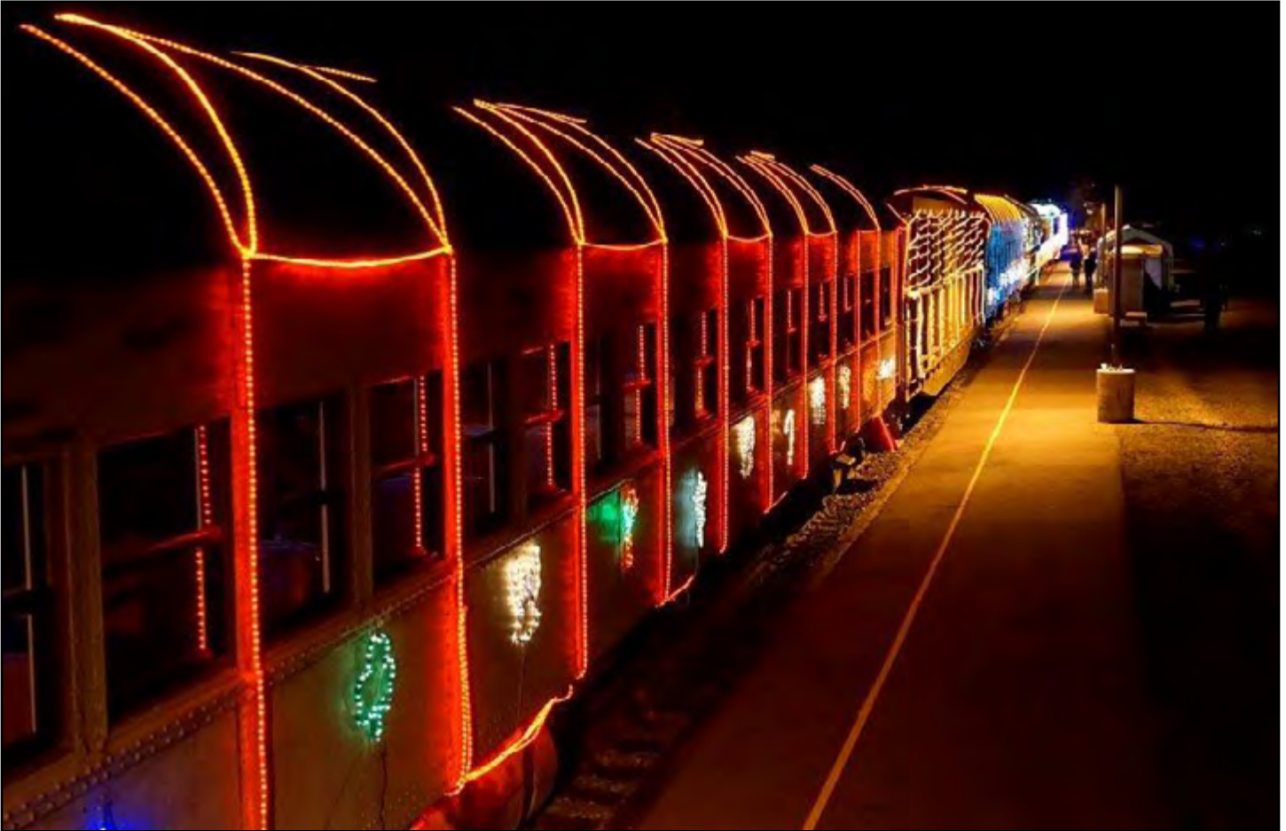
Train of Lights at Niles Station.