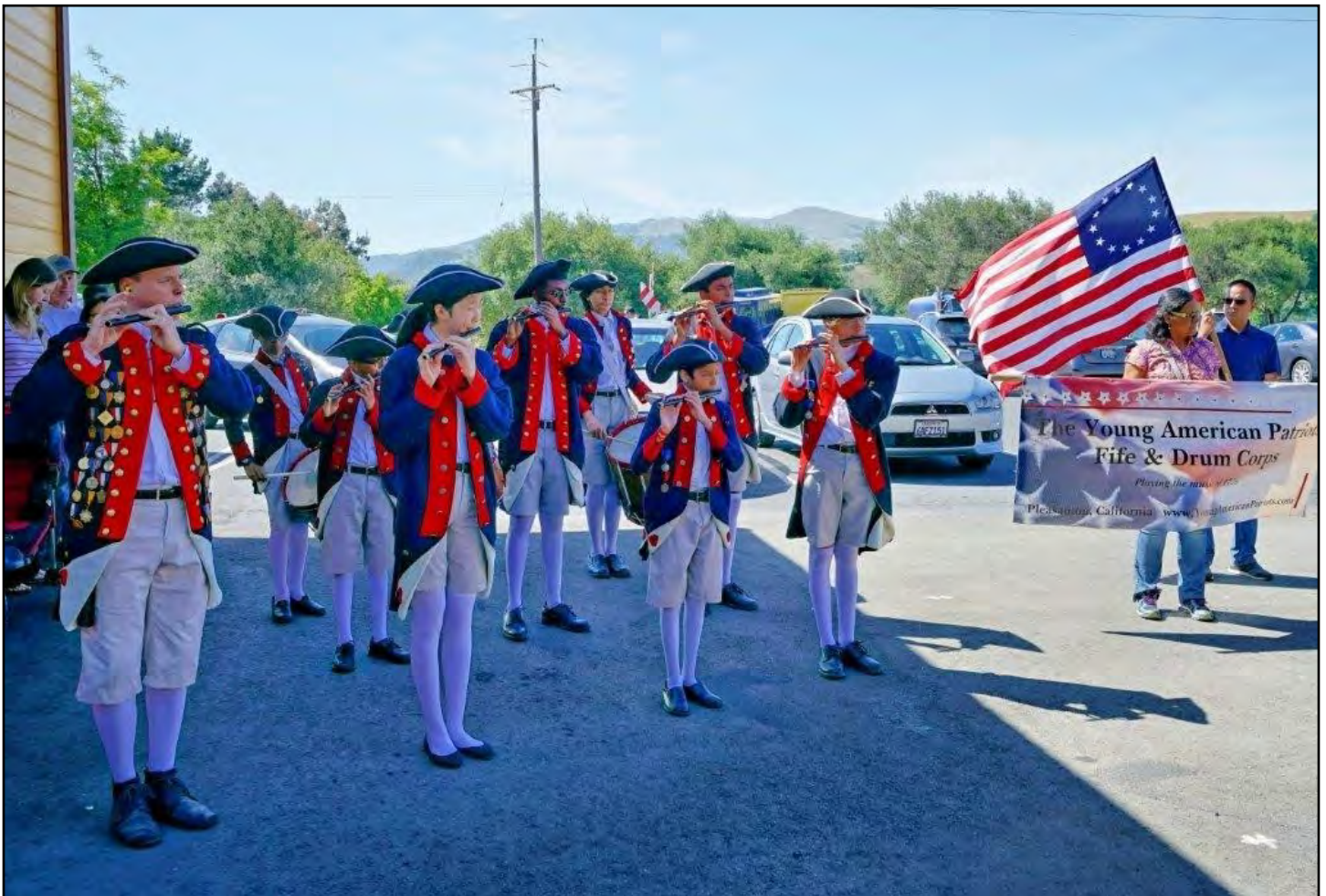
Sunol, 5/27/18 – The Young American Patriots Fife & Drum Corps from Pleasanton providing music of 1776 during the 2018 Memorial Day weekend.