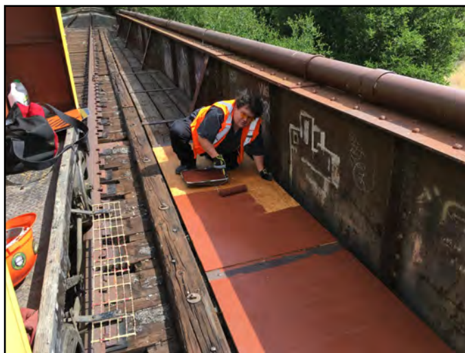
Joe Romani is caught in the act of painting a protective layer onto the new Arroyo Bridge walkway patch.

Big Bird needed to be re-shoed and, at 20", it