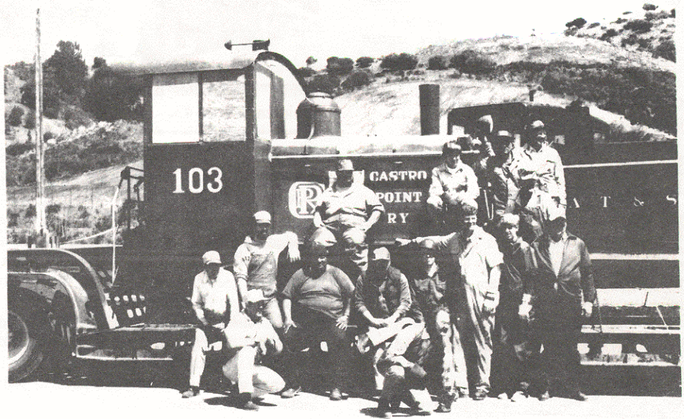
The crew that loaded #103 on a trailer pose with the Plymouth engine before sending it off to storage at Vallecitos.

With the purchase of one mile of ties - from milepost 33.7 to milepost 34.8 or from the Ki-lite plant heading east - and with a temporary work permit in hand, work began in Niles Canyon on Sunday, May 4. Primary track work projects were, are, and will be: cleaning dirt and ballast off of ties, plugging old spike holes, loading and hauling rail from San Jose, setting up rail on the right-of-way, and spiking down our rail on our ties (one