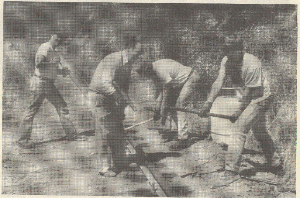
The efforts of members like these brought PLA rail 4953 feet closer to Sunol during July.

Next month we will have an update on the First Mile Fund, including contributors and the amount we have collected to date.