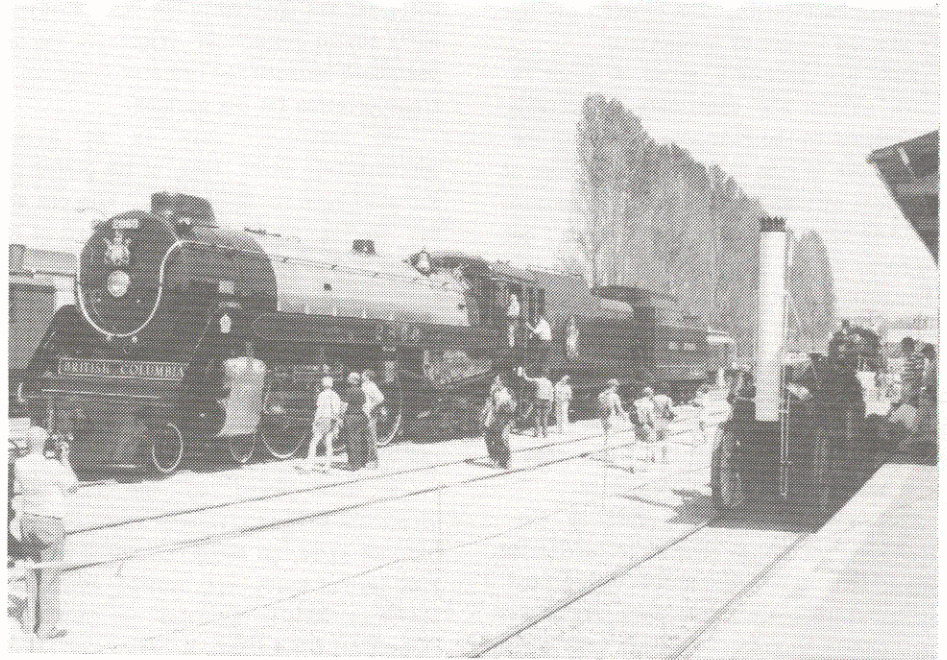
#2860 took center stage at STEAMEXPO last year, coming to a stop near the Stephenson's Rocket replica (above). Below it is seen from the cab of our own Pickering #12.

The PLA is circulating NORCAL's flyer as a way of showing appreciation for their support of us, including a recent donation towards our Niles Canyon Railway.